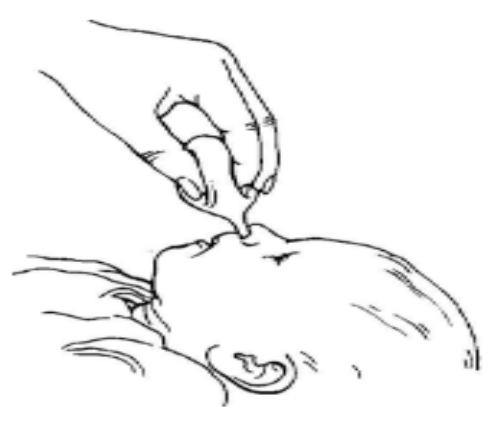
2 - Gently place the tip of the squeezed bulb into a nostril.