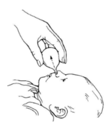
3 - Release the bulb to let the air back into the bulb. This will pull the mucus out of the nose and into the bulb.